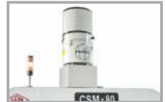
Oil Mist Filter