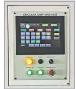
Touch Screen Display