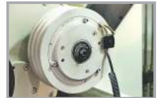
Electro Magnetic Powder Brake